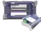
TBERD with MPO Switch