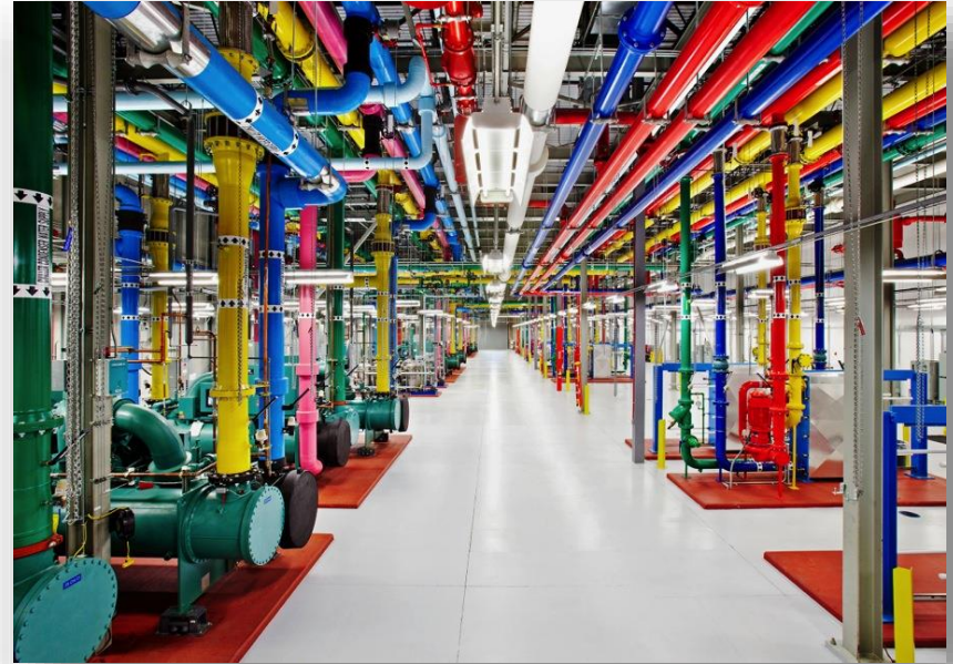
A central cooling plant in Google's Douglas County, Georgia data center.