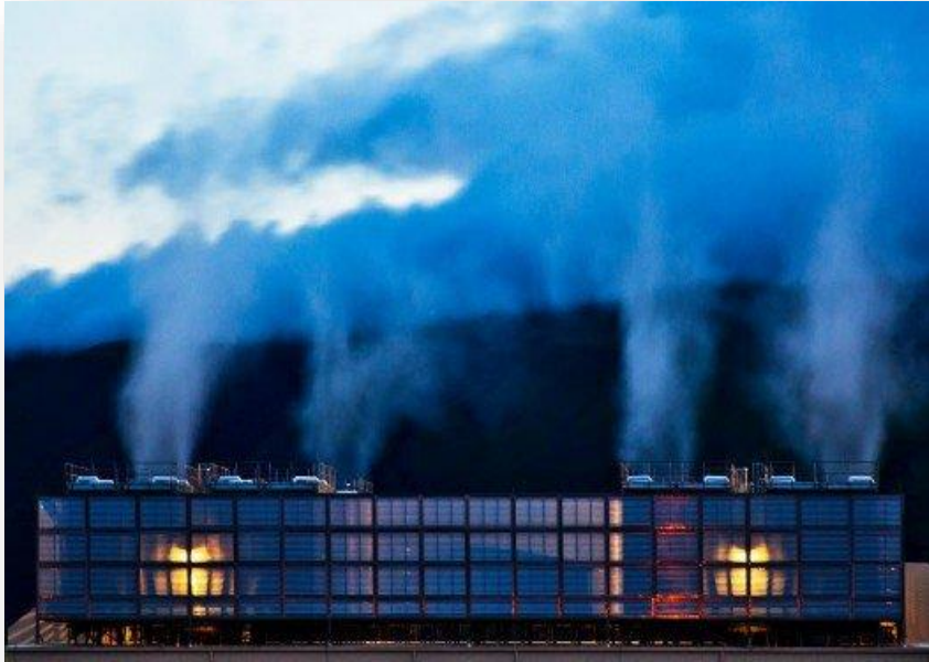
Cooling Towers at Google's Data Center in The Dalles, Oregon